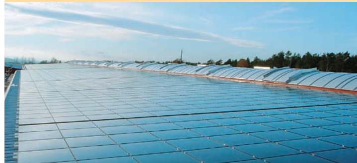
340 kW, German factory rooftop

Single-layer glass with polymeric backskin lowers pounds per watt and transportation costs. Modules are sized to optimize the greatest amount of power, easily handled by one person.